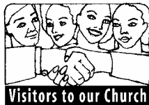
Visitors to our Church